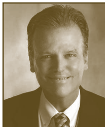
MAYOR JEFF NELSON Elected at-large